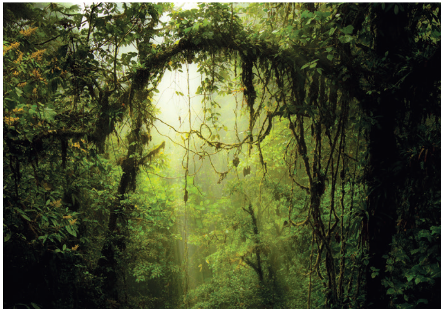
Conservation efforts risk getting snared in a tangle of aims.

AUTOBIOGRAPHY Carl Djerassi, father of the Pill, reflects on his life and literature p.36